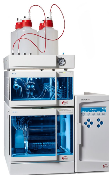
Fig. 2. ALEXYS Carbohydrate Analyzer

*) Depending on the lab ambient conditions an optional CT 2.1 column thermostat (186.ATC00) may be required to separate at temperatures between 25 - 30°C.